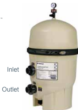
Clean & Clear Plus Filter

Clean & Clear Plus Filters have a corrosion resistant injection molded filter tank featuring superior strength and reliability. The cartridge assembly uses four easy to clean, non-woven, polyester cartridges. Each filter is supplied with a bulkhead union set for easy installation.